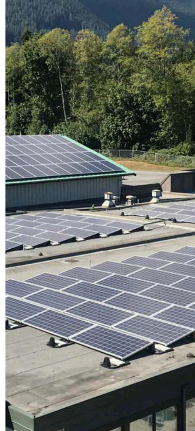
Photovoltaics – Sunshine Coast, BC