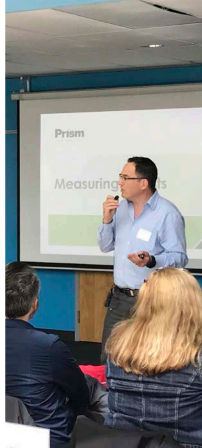
Sustainability Workshop – Vancouver, BC