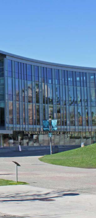
Energy Upgrades – Kamloops, BC