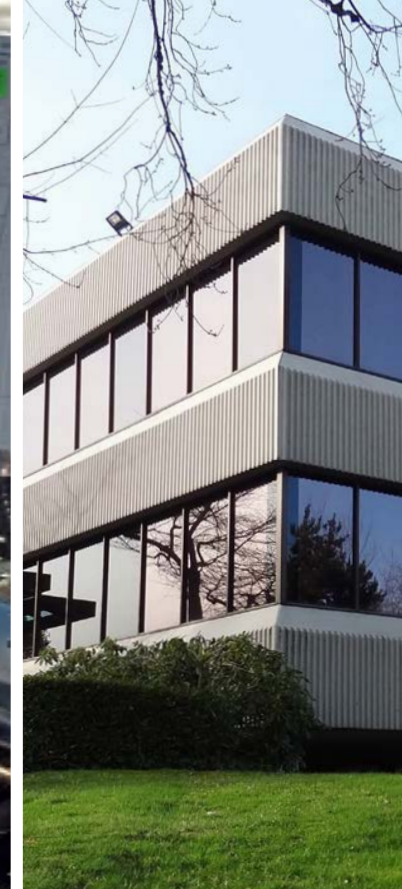
Facility Condition Assessment – Vancouver, BC