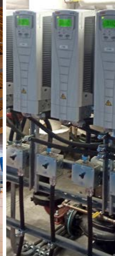
Decarbonization Upgrade – Cranbrook, BC