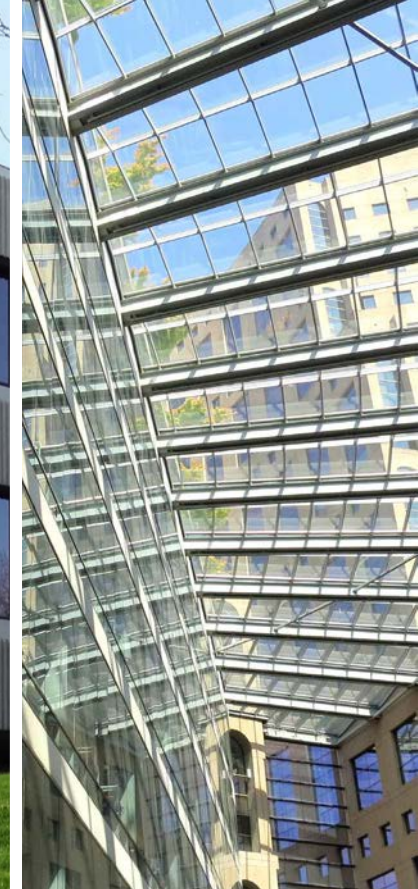
Commissioning Authority – Vancouver, BC