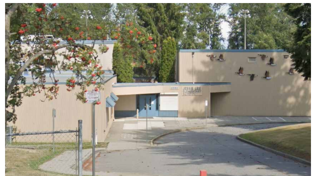
Photo credit: Western Financial Place (City of Cranbrook); and Jessie Lee Elementary (Google).

Expected results: The project is expected to achieve an annual GHG emission reduction of 75%.